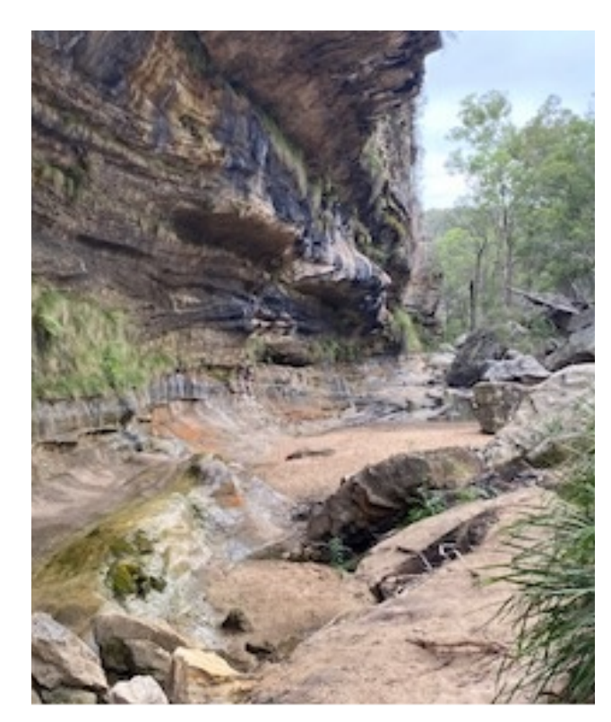
Snapshots from Mark's visit to Mudgee in December 2023